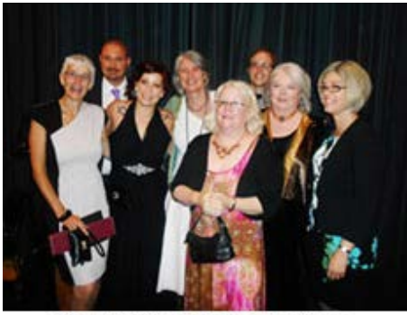
Debut Dagger shortlistees with Louise Penny

publishers. Our own Lee Child, recipient of the Diamond Dagger, was very gracious as he stood, drink in hand, on the canal bank and later signed autographs and posed for pictures. The venue of the awards was particularly significant to me, as I used to live a few streets away and still love the Kings Cross area. Perhaps the highlight of the evening, however, was the chance to speak with Louise Penny, who generously reminded me that she had been shortlisted for the debut dagger and hadn't won. I was told by many people at the event that I, having been shortlisted, was already a winner, and for that evening, I certainly believed it!!