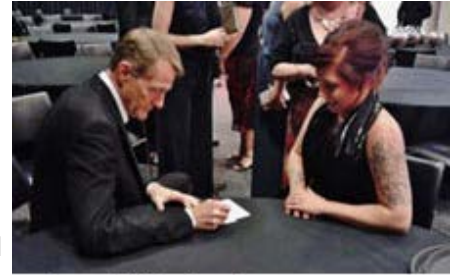
Lee Child signing a program.

publishers. Our own Lee Child, recipient of the Diamond Dagger, was very gracious as he stood, drink in hand, on the canal bank and later signed autographs and posed for pictures. The venue of the awards was particularly significant to me, as I used to live a few streets away and still love the Kings Cross area. Perhaps the highlight of the evening, however,